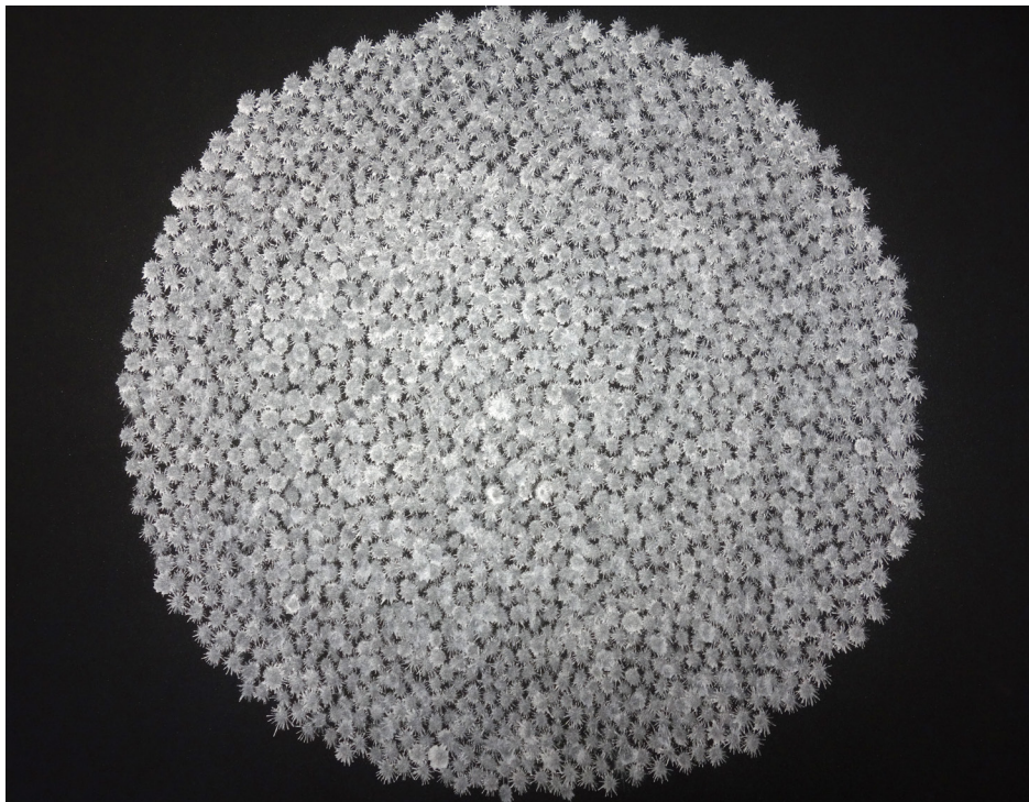
Athena Tacha, Singularity # 7 (Silver Stars) , 2002, airbrushed silver acrylic ink on black watercolor paper.

Tacha's Singularity series shifts perspective to a place where the expanse of the universe and the subatomic operations of matter collide, a point of extraordinary density such as that which gives rise to a black hole or which might lie at the origins of our known universe. A physical phenomenon that theoretically extends from the physical properties of matter just as chemically seething desert pools, lava, and ice flows do, cosmic singularities remain beyond direct human observation. Tacha's meticulous accumulations of individual marks executed in different media throughout the Singularity series allow us to ponder this life-generating and destroying force.