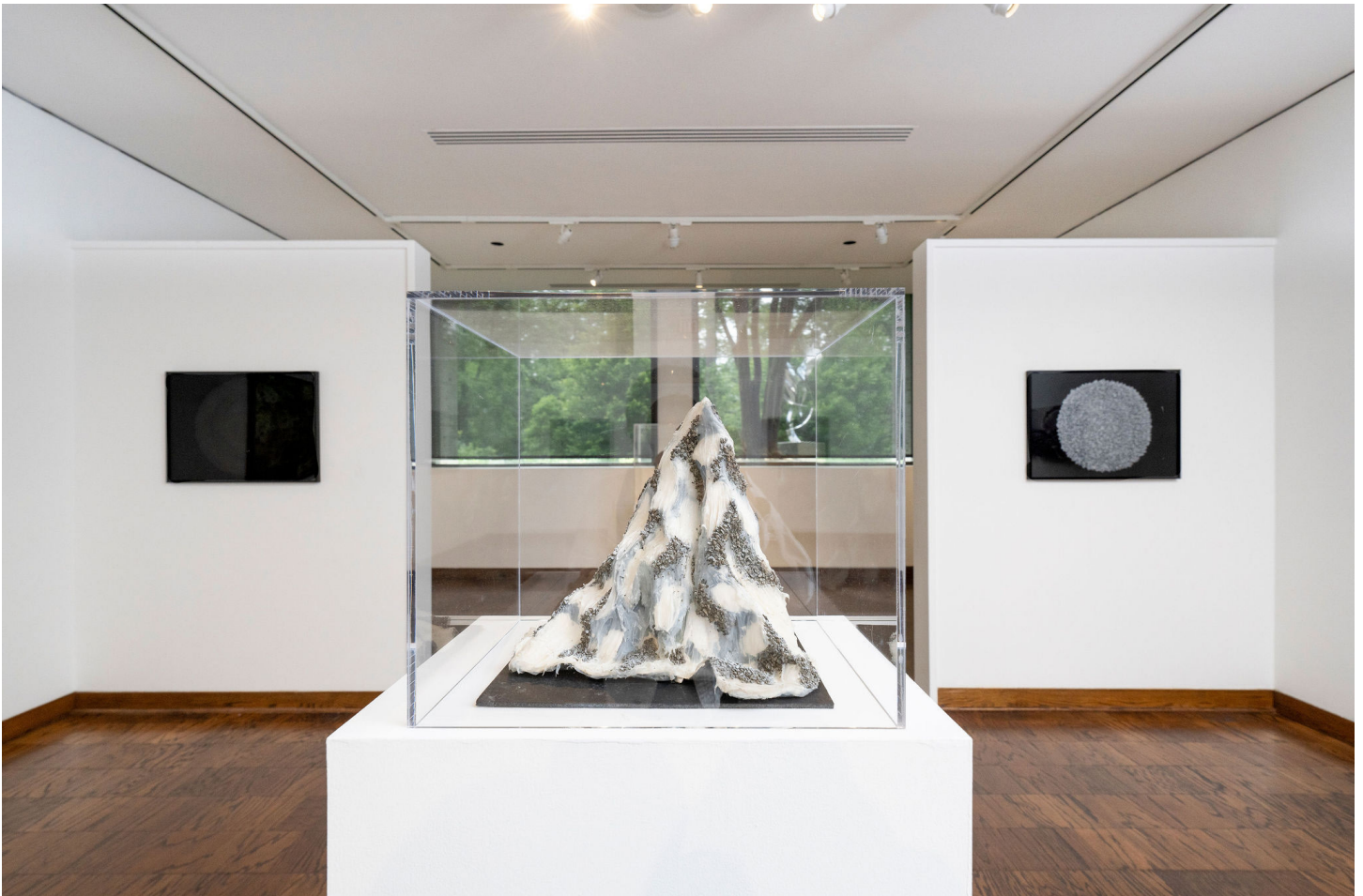
Left: Athena Tacha, Singularity #2 , 2001, graphite on black watercolor paper

Over her career spanning many media, Athena Tacha has investigated the rhythms of nature in drawing, photography, experimental books, sculpture, and public art. The systems and processes of the human body and the patterns and cycles of change inherent to other organisms and geological formations are interwoven throughout her multifaceted art. Small-scaled sculptures of an erupting volcano and an ice-capped mountain peak express the awesome physical intensity of nature in microcosm. And, by selecting, editing, and combining photographs of the hot, acidic waters of volcanically formed pools in Ethiopia's Dankali Depression, she makes quite palpable one of the most geologically extreme locations on Earth.