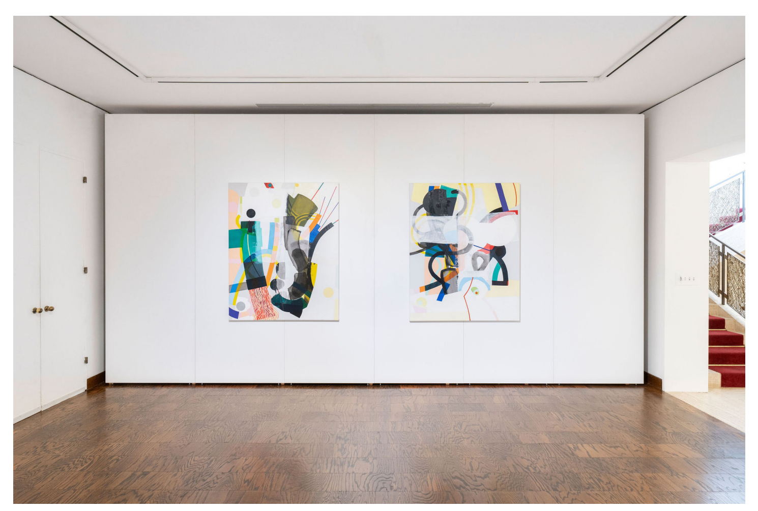
David Carlson, Blood is the Root and Call , 2020, acrylic and oil on canvas David Carlson, Qi Field , 2020, acrylic and oil on canvas

Understanding the natural world not as a realm differentiated from the human mind and body, but as a united field animated by the same vital energy, David Carlson makes abstract paintings where the external and internal kaleidoscope onto one another. By varying areas of thick, viscous paint with translucent passages, pulsing color with veiling whites, and cellular shapes with arterial networks, Carlson balances a dizzying variety of sensual form within the rectilinear boundaries of a painting.