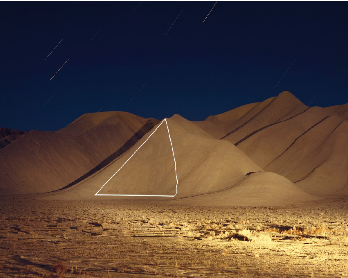
Top: Jim Sanborn, Bandon, Oregon II , 1997, large format projection, digital print. Bottom: Jim Sanborn, Cainville, Utah , 1995, large format projection, digital print.